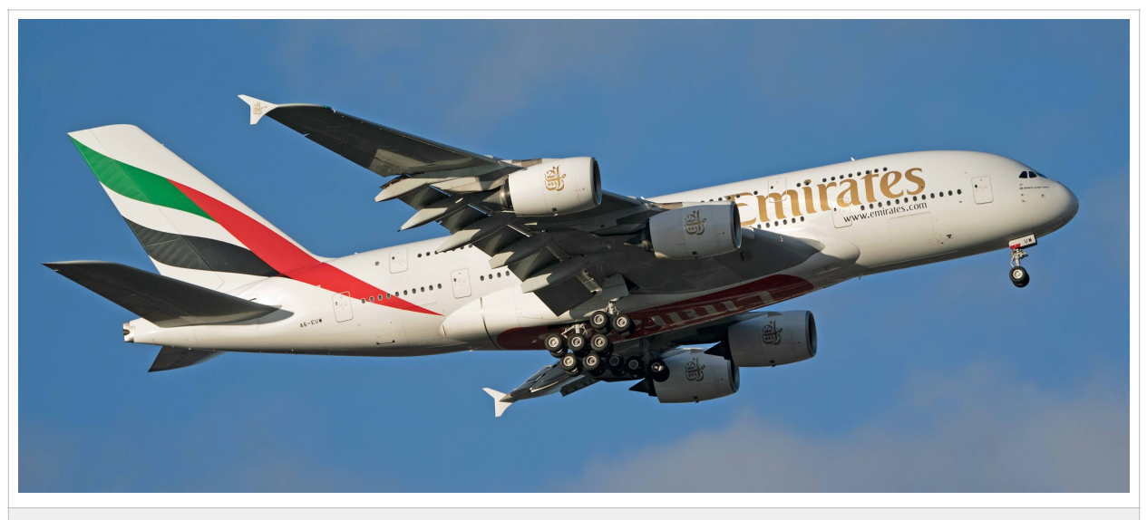
Figure 3. Airbus A380-800 Landing at Dulles International Airport (A. Trani).

d) Find the initial safe climb speed (1.2 times the stall speed in the takeoff flap configuration) with a takeoff mass of 520,000 kilograms in Denver , Colorado. Assume ISA conditions. Comment on the differences observed.