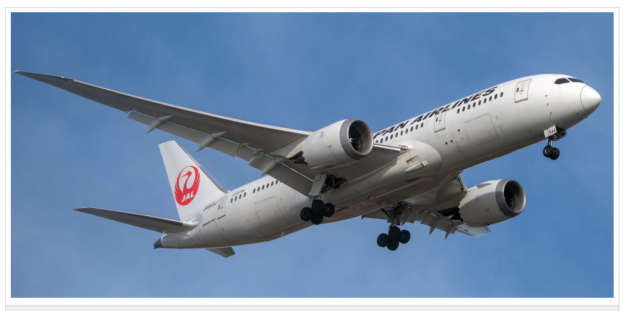
Figure 1. Boeing 787-8 Landing at San Diego International Airport (A. Trani).

Note: For this problem, you can use the Matlab scripts provided in class. However, for one of the problems, I would like you to show me a sample calculation using the equation to convert IAS to true Mach and then True Airspeed (TAS).