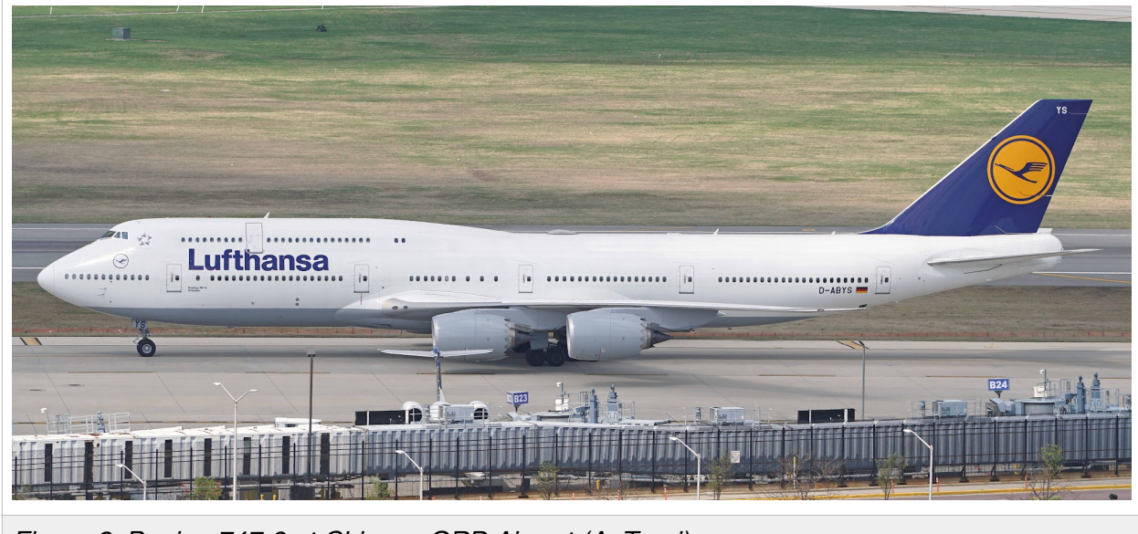
Figure 2. Boeing 747-8 at Chicago ORD Airport (A. Trani).