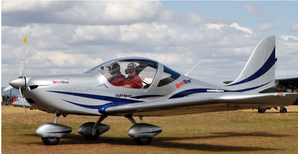
Figure 3. Evezkor-Aerotechnik EV-97.

f) Find the suitable runway length needed to accommodate light sport aircraft such as the Evezkor-Aerotechnik EV-97 (see Figure 3) with a stalling speed of 40 knots. The runway will be at an airport located 4,510 feet above mean sea level conditions.