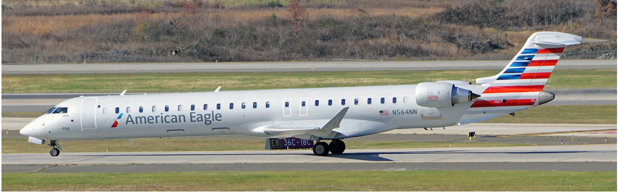
Figure 4. Bombardier CRJ-900 Aircraft Taxiing at CLT Airport (A. Trani).