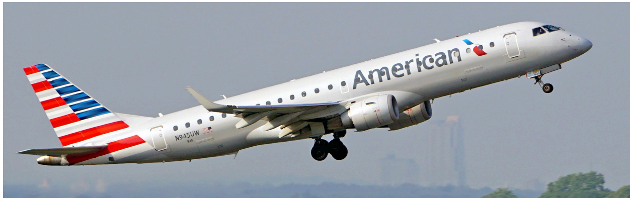
Figure 1. Embraer 190 Regional Aircraft Departs LGA Airport .

A new airport in Nevada is expected to serve business jets and regional jets using a single 7,500 foot runway. The airport is expected to have an ILS Category 1 precision approach system available to both runway ends. After consultation with airlines and corporate flight departments, the largest and most critical aircraft to operate from the facility is the Embraer190 regional airliner (see Figure 1). The aircraft has an approach speed of 136 knots at maximum allowable landing weight.