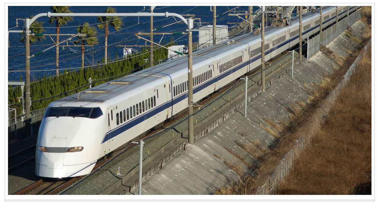
Figure 1. High-speed Train (Shinkansen 300 series).